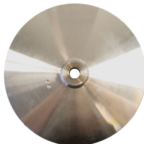
Aluminium Disc only 368mm (14 1/2")