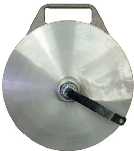
Aluminium Disc Set

includes 2 x Aluminium discs, a centre clamping plate with carry handle plus bolt set