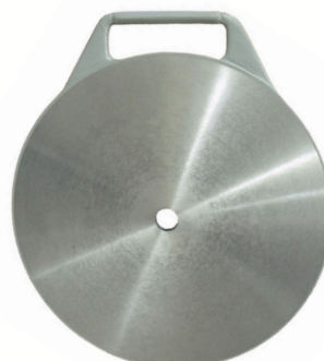
Aluminium Clamp Plate only 368mm (14 1/2")